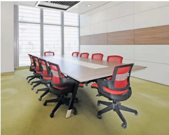
Meeting—functional setting, inspired ambiance.

FACTS Address Ooredoo Tower, Soor Street, Kuwait City / P.O.Box 613 Safat 13007 Kuwait Industry Telecommunications Size 331 workstations Products P2_Group, DOCKLANDS, M_Com Table, T-Meeting Bene Spectrum Expressive, Spice