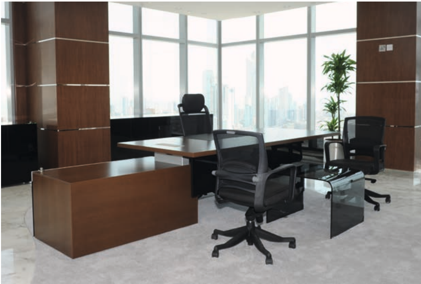
The management offices are stylish and prestigious.