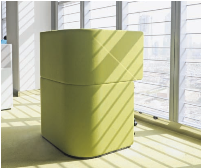
Perfect for a temporary check-in. Field staff can find a home base here.