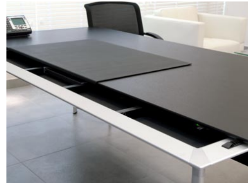
... the drawer for personal belongings — unclosed optionally by Smart ID electronic key.