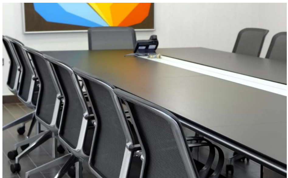
Filo chair — comfortable and stylish at the same time.