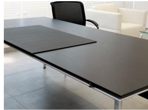
Special feature of AL-desk...