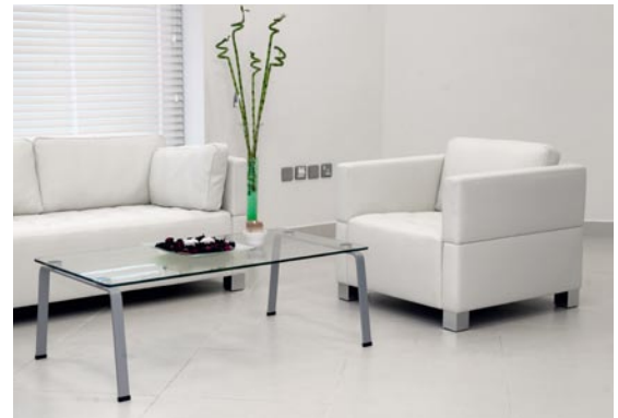
Casual sofa for conversation and relaxation.