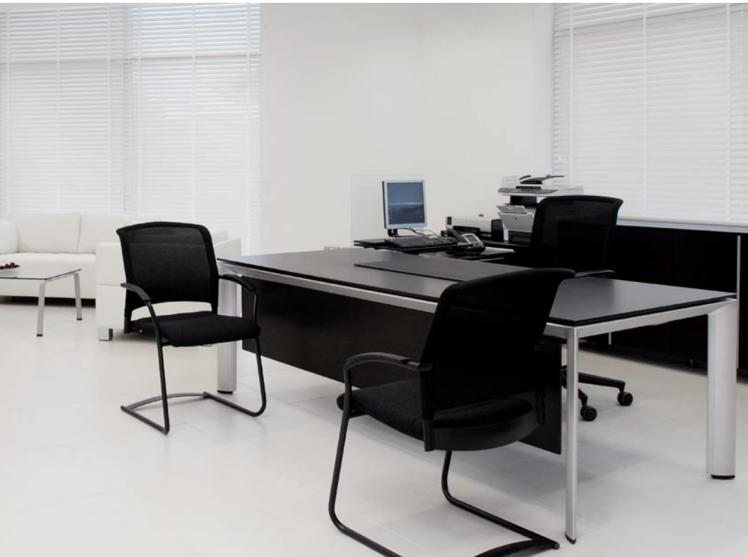
Generous management office.